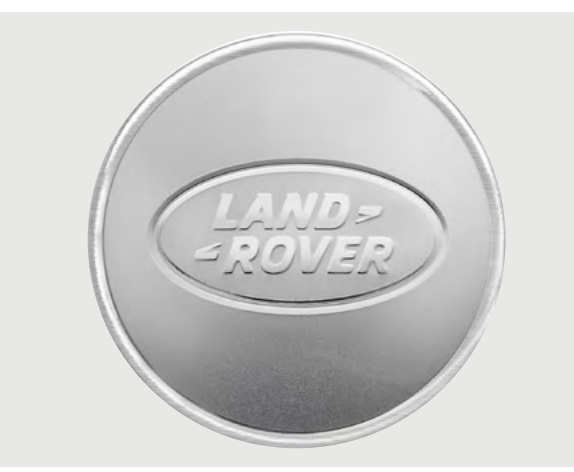
Silver Wheel Centre Cap Enhances and adds style to alloy wheels. Features Land Rover logo.

Black Finish Wheel Centre Cap Enhances and adds style to alloy wheels. Features Land Rover logo.