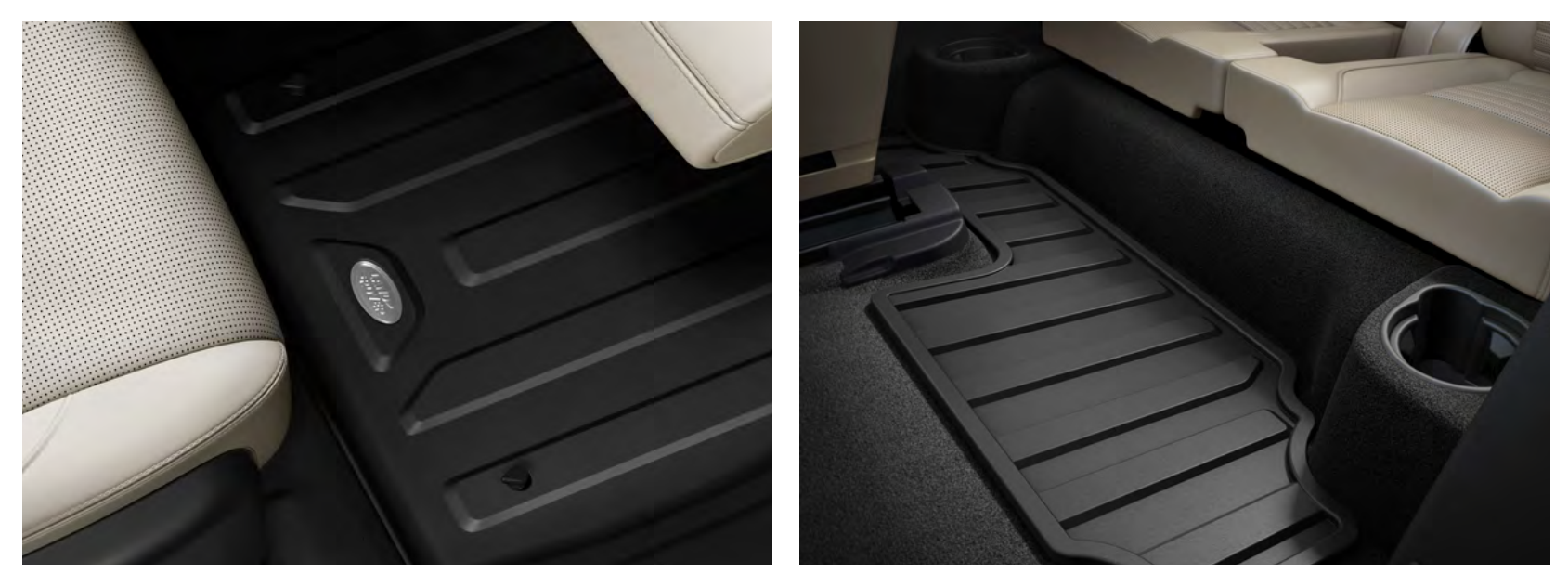
Rubber Floor Mats Rubber footwell mats help provide protection from general dirt.

Loadspace Rubber Mat Extension This waterproof mat extension covers the back of the rear seats when they are folded down.