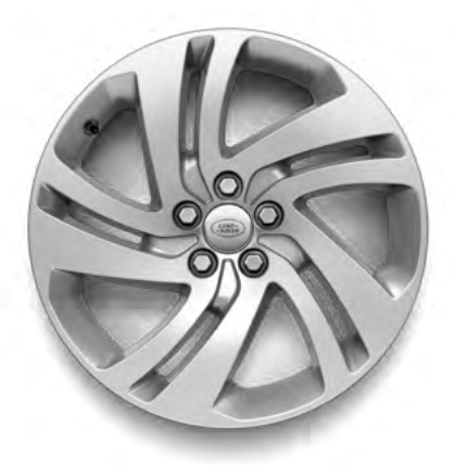
18" Style 5074