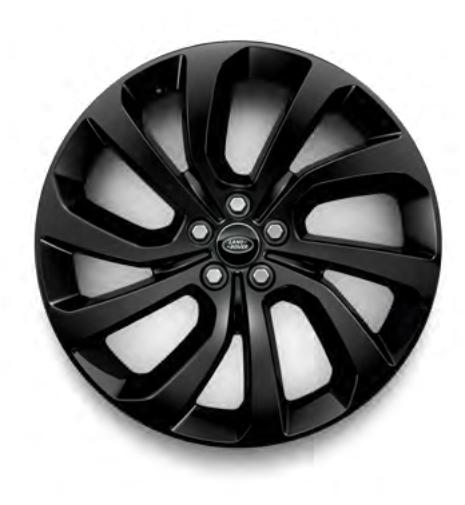
20" Style 5089, Gloss Black

Personalise your vehicle with a selection of alloy wheels featuring a wide range of contemporary and dynamic designs.