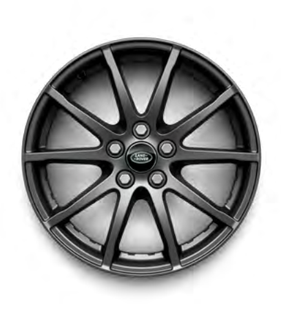
17" Style 1005, Satin Dark Grey

Personalise your vehicle with a selection of alloy wheels featuring a wide range of contemporary and dynamic designs.