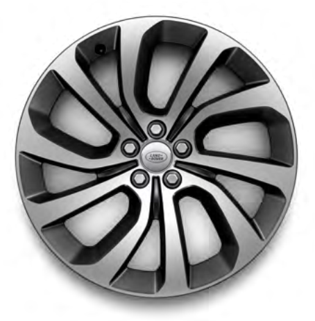
20" Style 5089, Diamond Turned with Gloss Dark Grey contrast