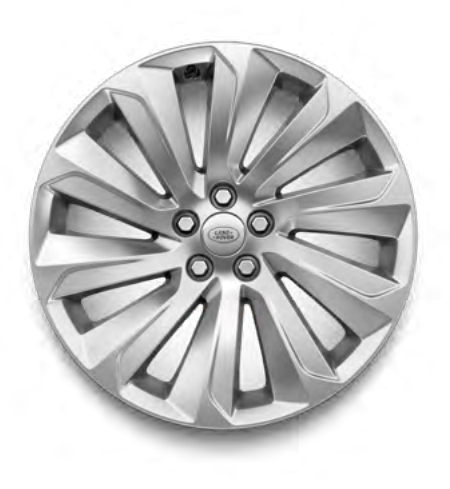
19" Style 1039