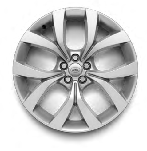
20" Style 5076