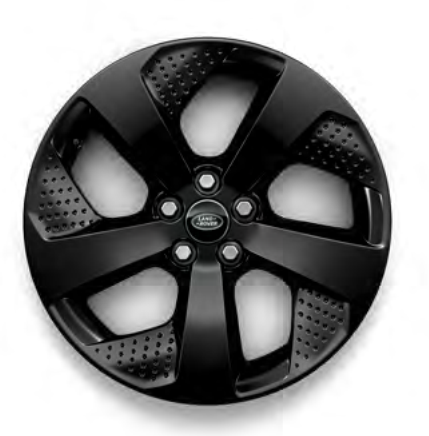
18" Style 5088, Gloss Black