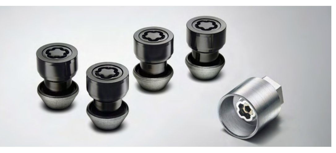
Gloss Black Finish Locking Wheel Nuts

Set of 20 wheel nuts, especially suitable for use with Gloss Black finish alloy wheels.