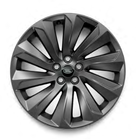
19" Style 1039, Satin Dark Grey