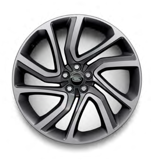
21" Style 5090, Diamond Turned with Gloss Dark Grey contrast