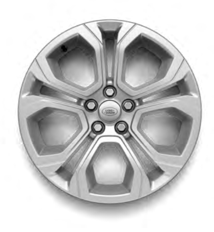
18" Style 5075