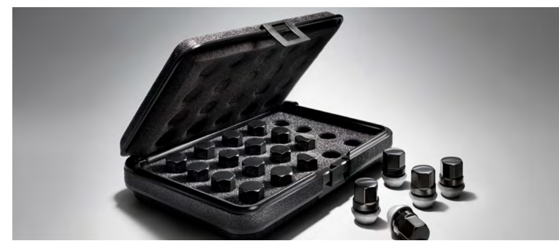
Gloss Black Finish Wheel Nuts

Set of 20 wheel nuts, especially suitable for use with Gloss Black finish alloy wheels.