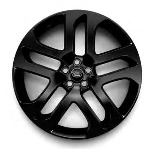
21" Style 5078, Gloss Black