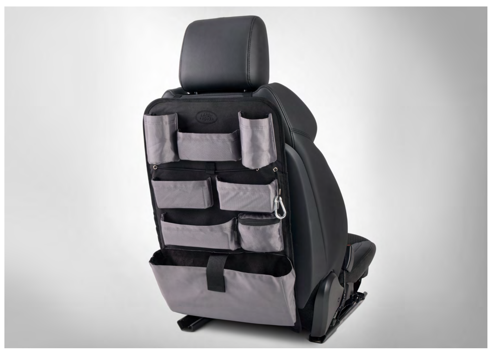
Seat Back Stowage

Manufactured from the same premium leather offered on the vehicle, complemented with soft touch interior lining and magnetic button clasps. Provides a convenient stowage solution for the rear of the front seats with multiple compartments for stowing small items.