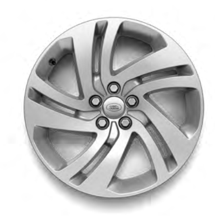
18" Style 5074