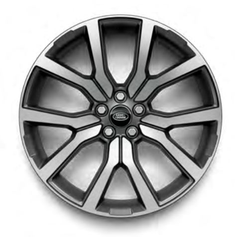
20" Style 5115, Diamond Turned with Satin Dark Grey contrast