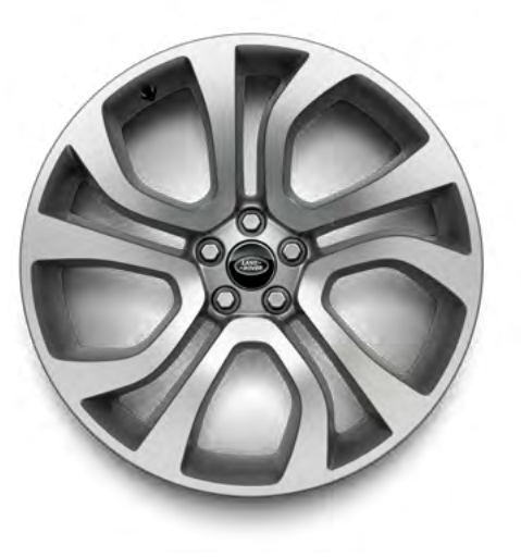
21" Style 5077, Diamond Turned with Gloss Light Silver contrast