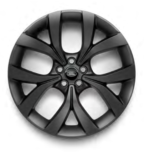
20'' Style 5076, Satin Dark Grey