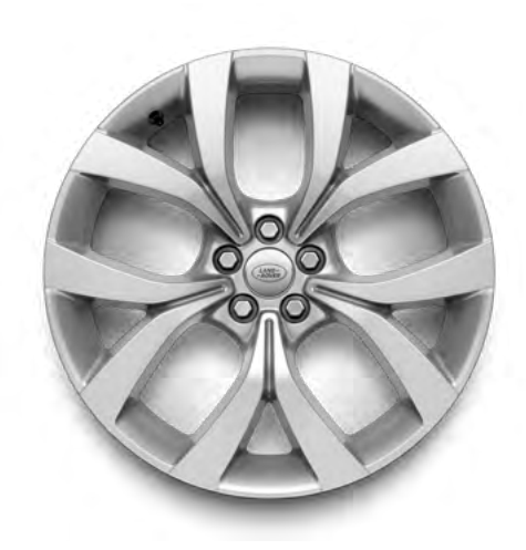
20" Style 5076