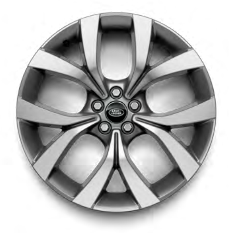
20" Style 5076, Diamond Turned with Gloss Mid-Silver contrast