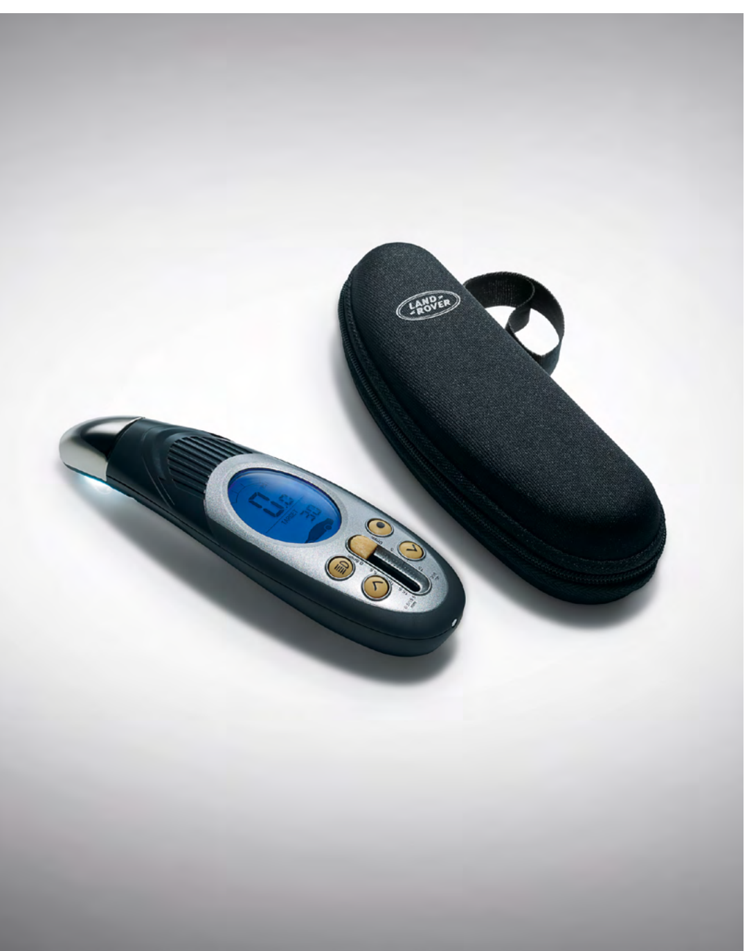
Tyre Pressure Gauge

Snow traction system is designed to give improved steering and braking control on snow and ice, when fitted to front wheels. Easy-fit design, manufactured from high quality hardened galvanised steel, the chains are supplied in a tough vinyl carry bag for storage when not in use.