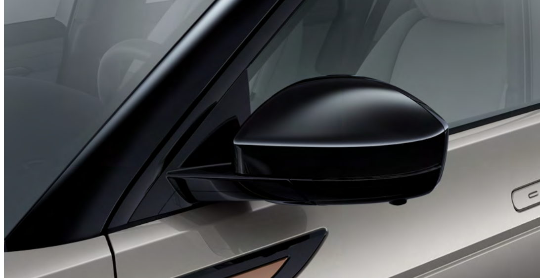
Gloss Black Mirror Covers

Noble Chrome mirror covers to enhance the vehicle's exterior design cues.