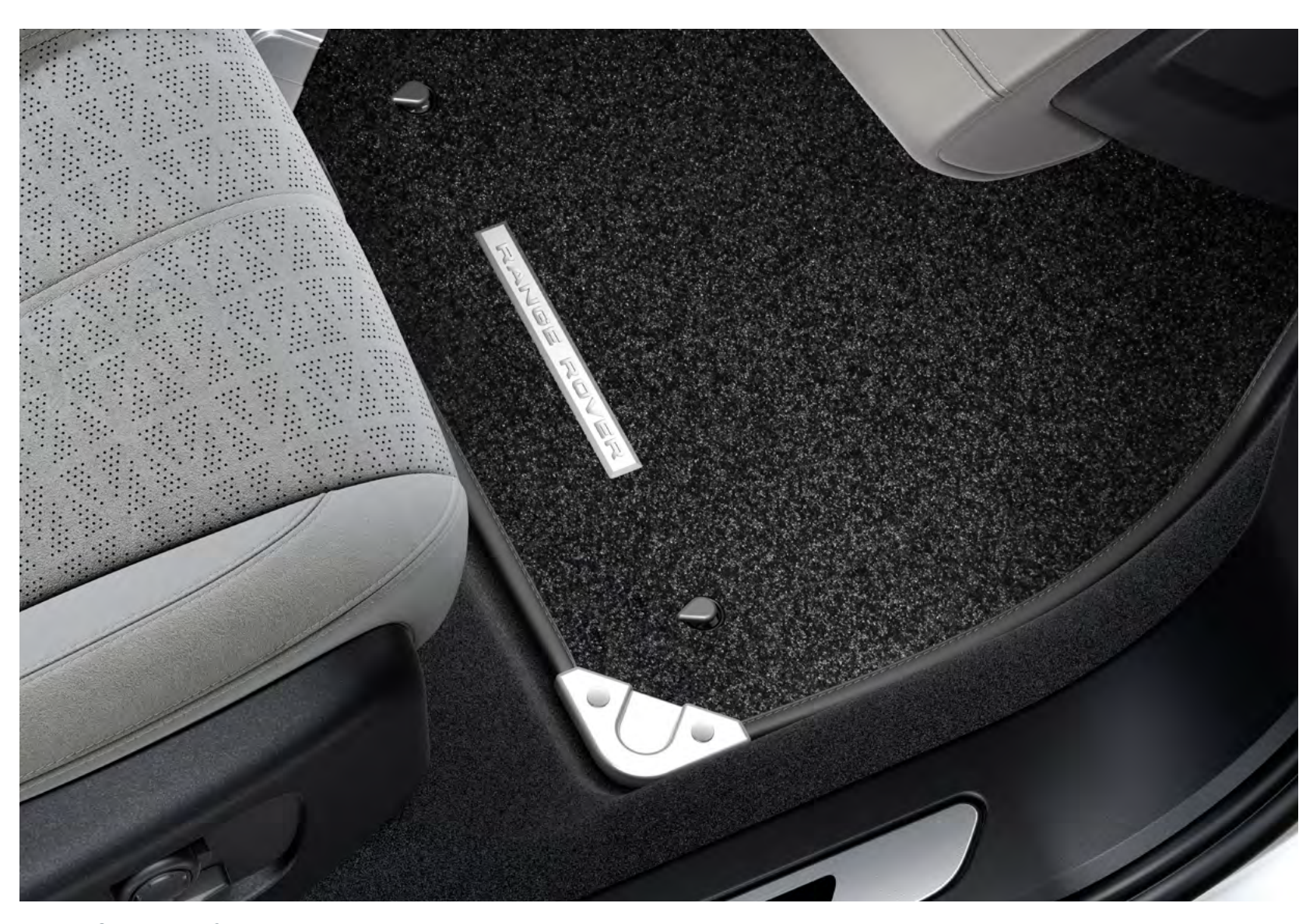
Luxury Carpet Mat Set

Luxurious, 2,050gm<sup>2</sup> deep pile carpet mat set with Range Rover ingot branding, metal corner pieces and waterproof backing provides a well-appointed finishing touch to the interior.