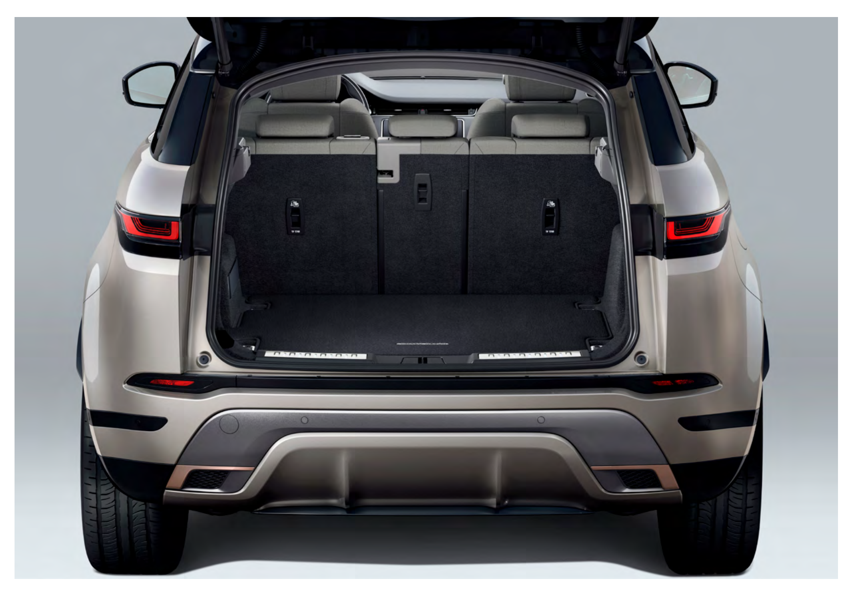
Loadspace Luxury Carpet Mat

Luxurious, soft, 2,050gm2 deep pile loadspace carpet mat with Range Rover branding and waterproof backing. Supplied in Ebony to complement the vehicle's interior.