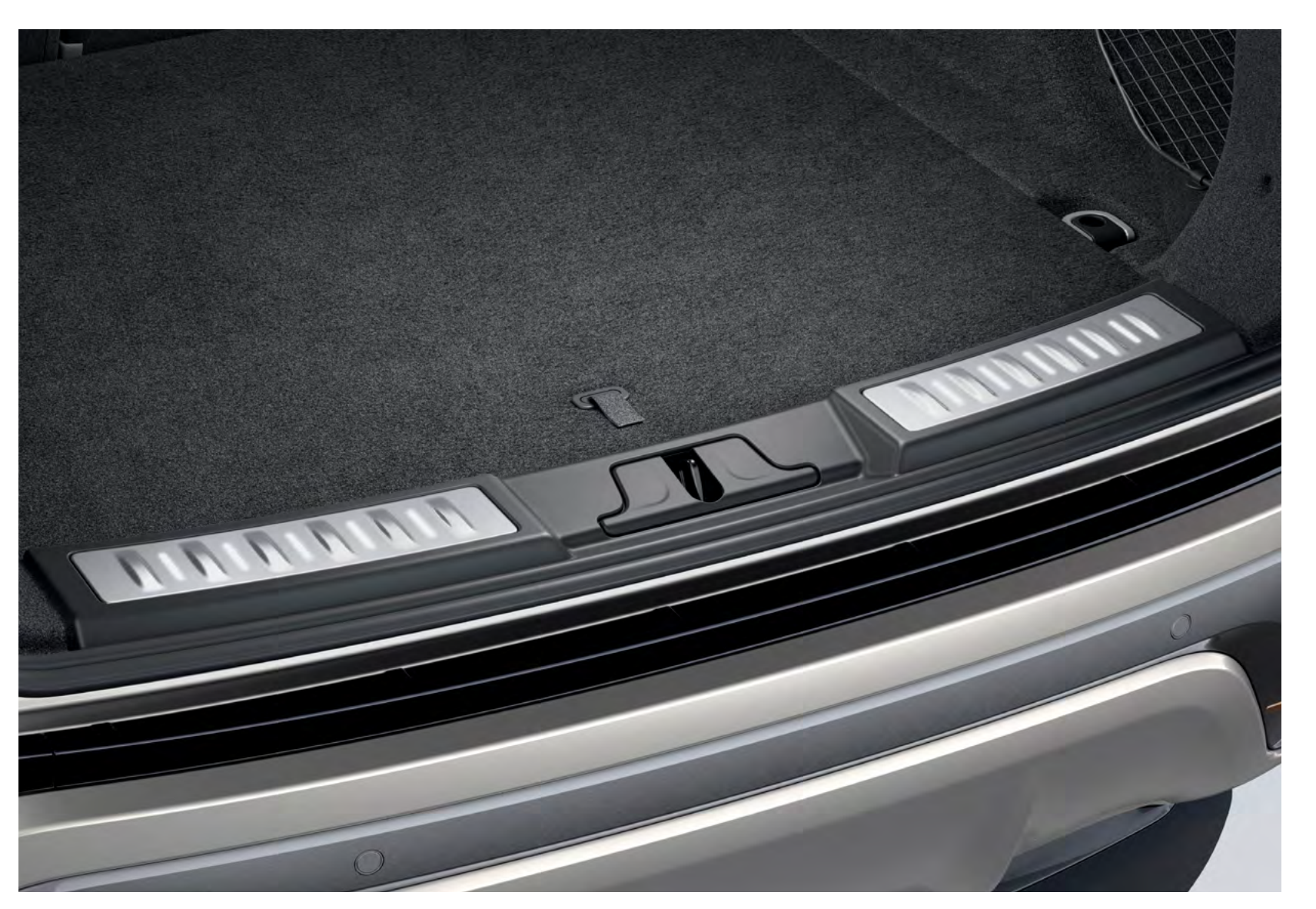
Loadspace Treadplate Finisher - Illuminated

Luxurious, soft, 2,050gm2 deep pile loadspace carpet mat with Range Rover branding and waterproof backing. Supplied in Ebony to complement the vehicle's interior.