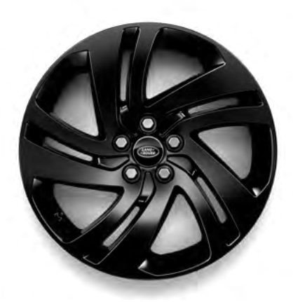
18" Style 5074, Gloss Black