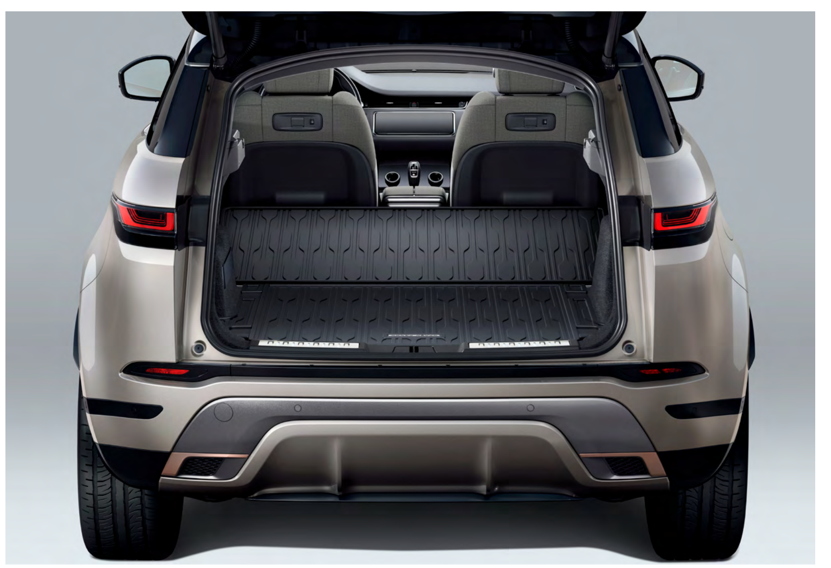
Loadspace Rubber Mat Extension

Black, waterproof loadspace rubber mat offers protection of the loadspace floor.