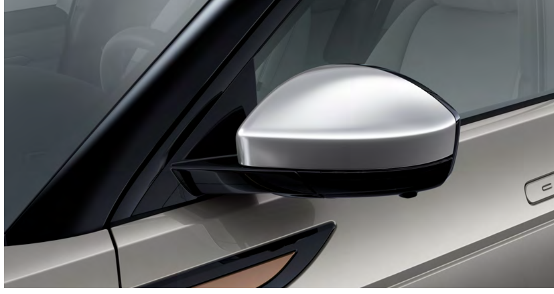
Noble Chrome Mirror Covers

Stunning high grade Carbon Fibre mirror covers, with a High Gloss finish, provide a performance-inspired premium styling upgrade.