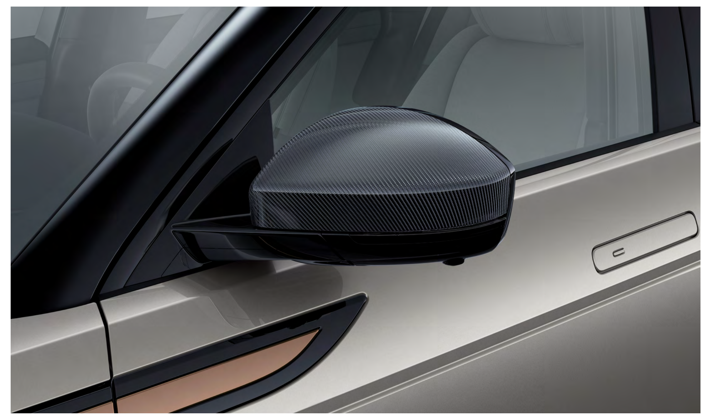
Carbon Fibre Mirror Covers

Stunning high grade Carbon Fibre mirror covers, with a High Gloss finish, provide a performance-inspired premium styling upgrade.