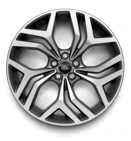
20" Style 5079, Diamond Turned with Gloss Dark Grey contrast