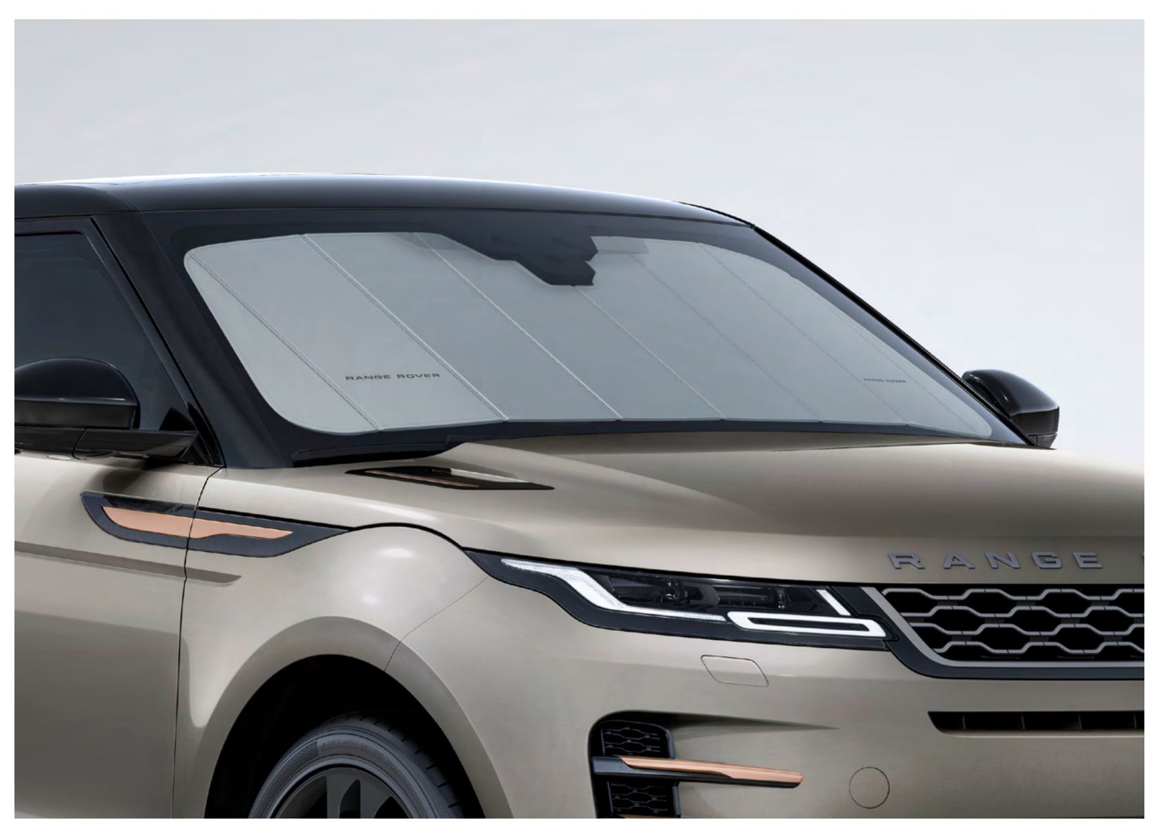
Windscreen Sun Shield

UV windscreen sun shield reflects the sun's rays and helps to keep the vehicle interior cool in hot weather.