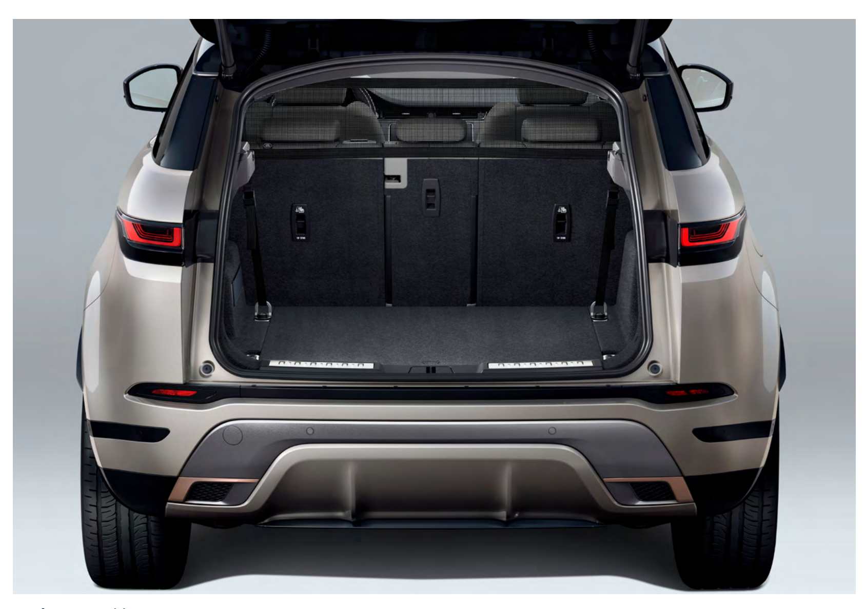
Loadspace Partition Net

Convenient loadspace partition net helps protect passengers from stowed items. Easily detachable for when carrying longer loads.