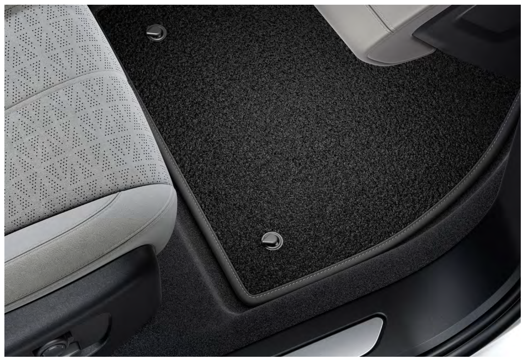
Premium Carpet Mat Set

Luxurious, 2,050gm<sup>2</sup> deep pile carpet mat set with Range Rover ingot branding, metal corner pieces and waterproof backing provides a well-appointed finishing touch to the interior.