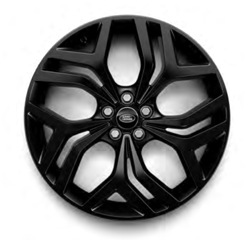
20" Style 5079, Gloss Black

Personalise your vehicle with a selection of alloy wheels featuring a wide range of contemporary and dynamic designs.