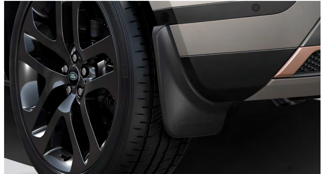
Mudflaps - Front and Rear

Mudflaps are a popular upgrade for reducing spray and ensuring paintwork is protected from debris and dirt. Designed to complement vehicle exterior styling. Also available on non R-Dynamic vehicles.