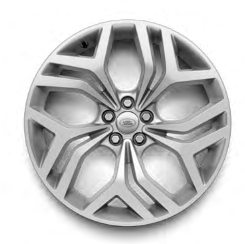
20" Style 5079