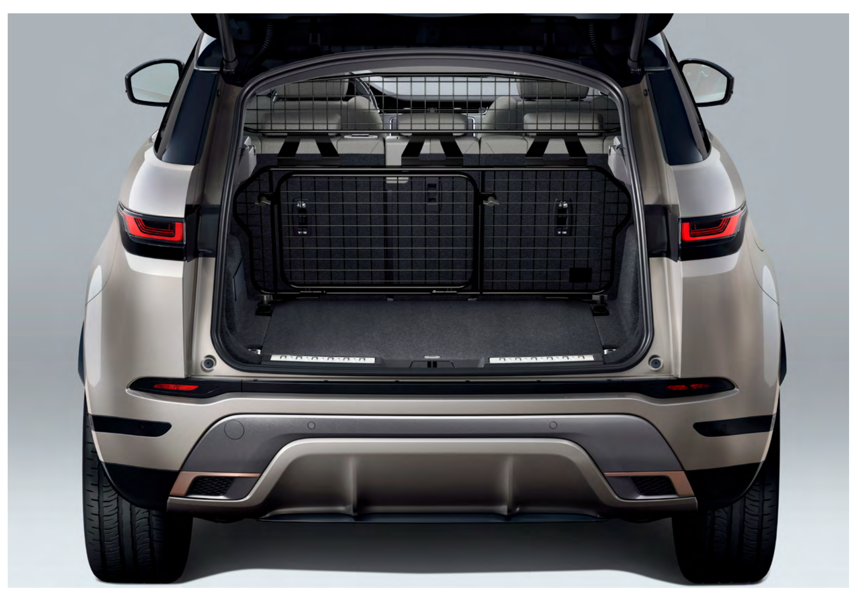
Luggage Partition - Full Height

Convenient loadspace partition net helps protect passengers from stowed items. Easily detachable for when carrying longer loads.