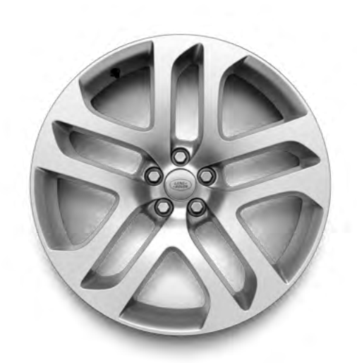
21" Style 5078