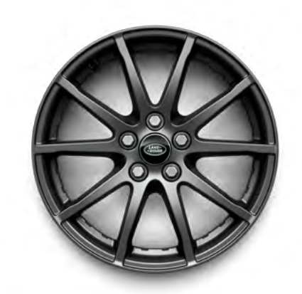
17" Style 1005, Dark Grey Satin

Personalise your vehicle with a selection of alloy wheels featuring a wide range of contemporary and dynamic designs.