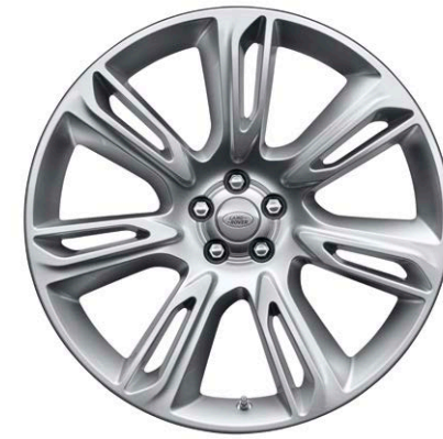
20" Style 7014