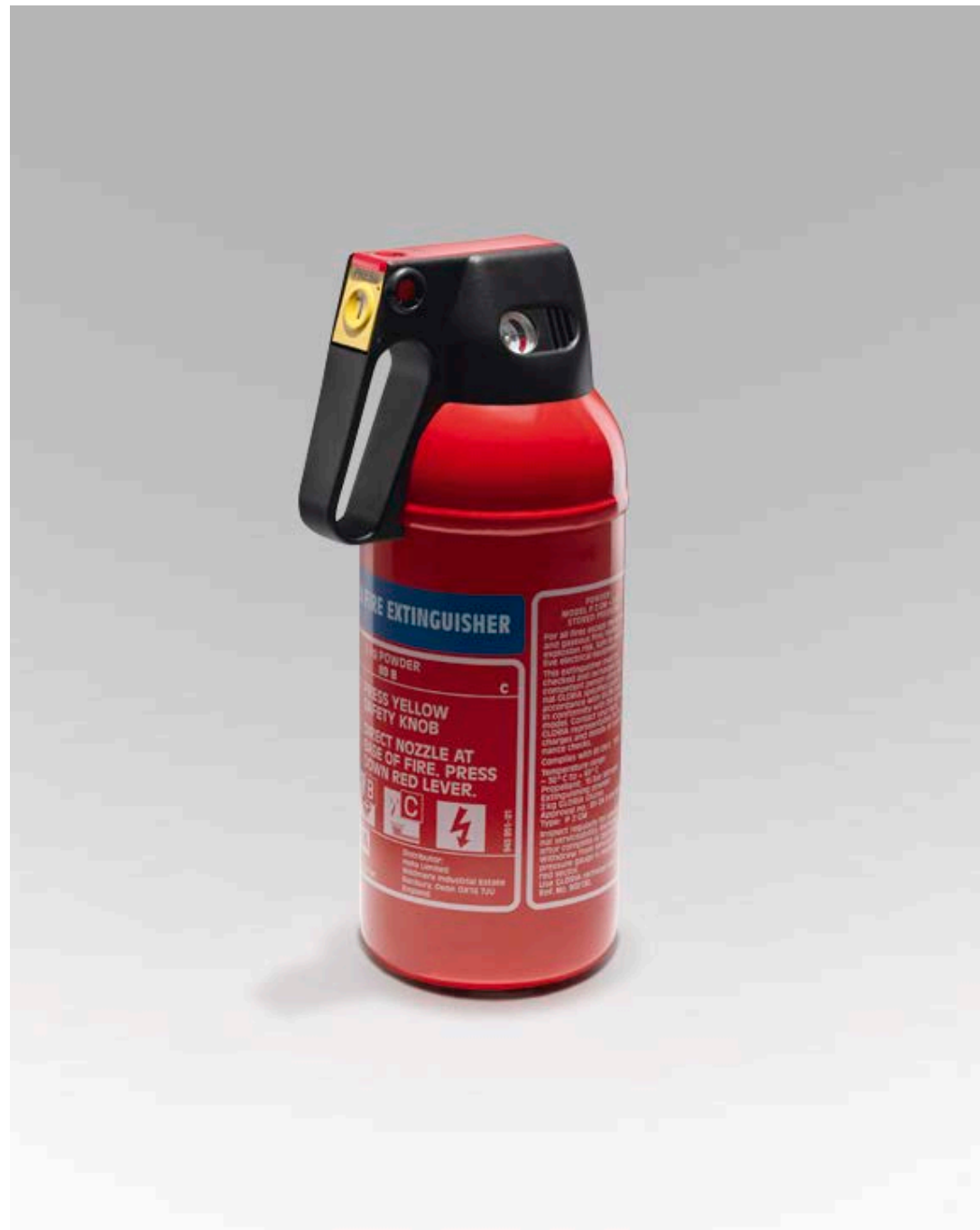
Fire Extinguisher - 1kg

Dry powder fire extinguisher, supplied with mounting bracket.