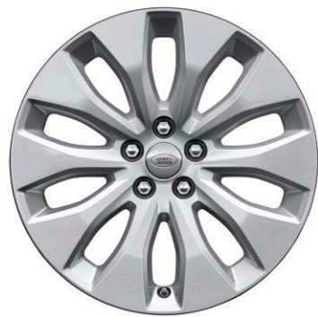
18" Style 1021

Personalise your vehicle with a selection of alloy wheels featuring a wide range of contemporary and dynamic designs.