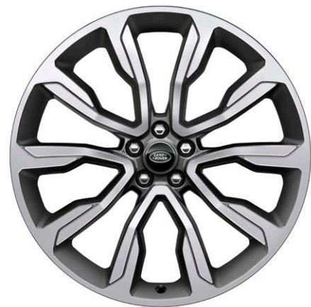
22" Style 1051, Diamond Turned with Satin Technical Grey contrast