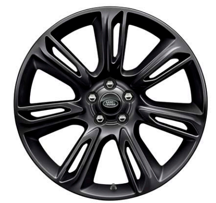
20" Style 7014, Gloss Black