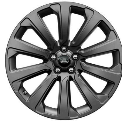
20" Style 1032, Satin Dark Grey