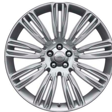
22" Style 9007