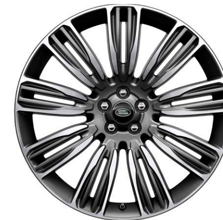
22" Style 9007, Diamond Turned with Satin Light Silver contrast