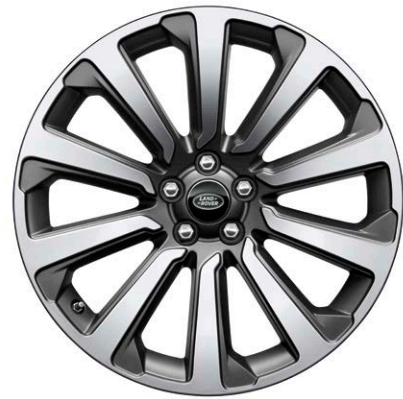
20" Style 1032, Diamond Turned