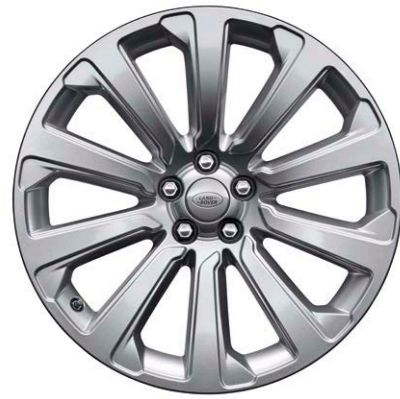
20" Style 1032