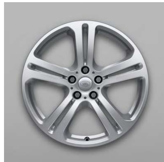
20" Style 5134