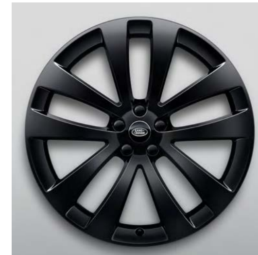
23" Style 5135, Gloss Black