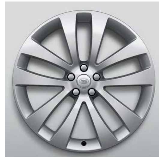
23" Style 5135