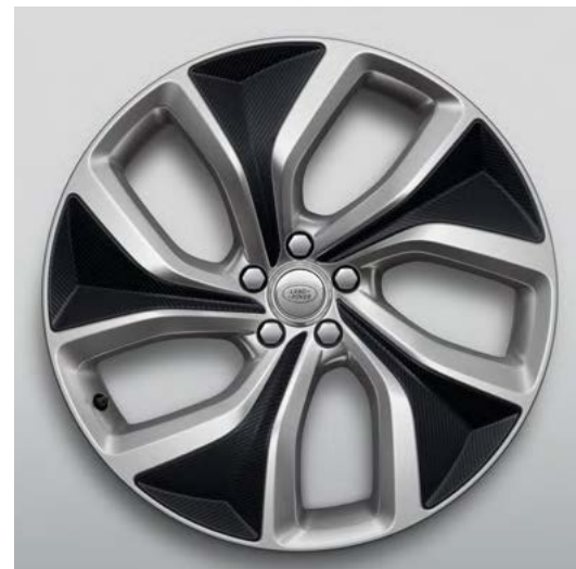
23" Style 5128, Titan Silver with Carbon Fibre inserts