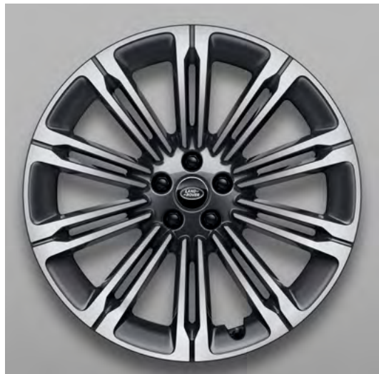
23" Style 1075, Diamond Turned with Dark Grey contrast