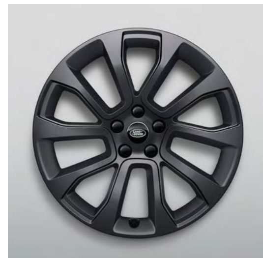
21" Style 5126, Satin Dark Grey