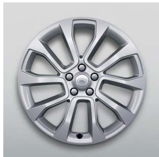
21" Style 5126