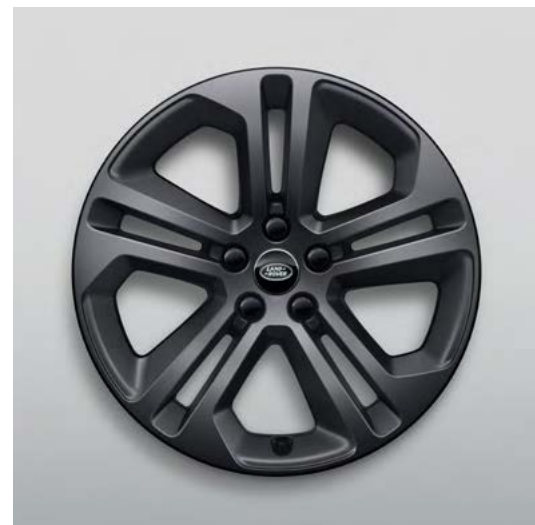
20" Style 5125, Satin Dark Grey