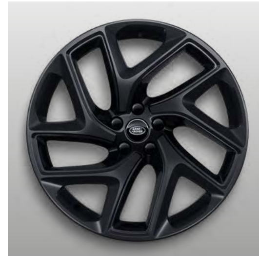
22" Forged Style 5131, Satin Black and Gloss Black