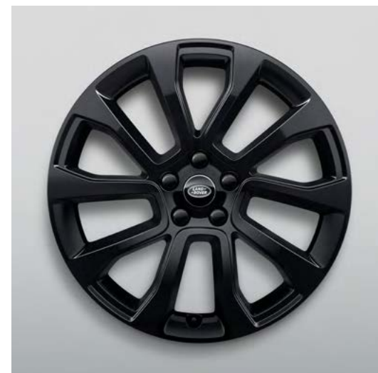
21" Style 5126, Gloss Black