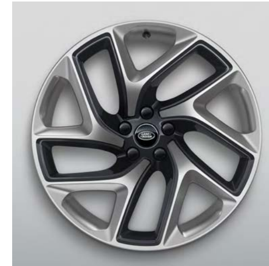
22" Forged Style 5131, Titan Silver and Dark Gloss Grey