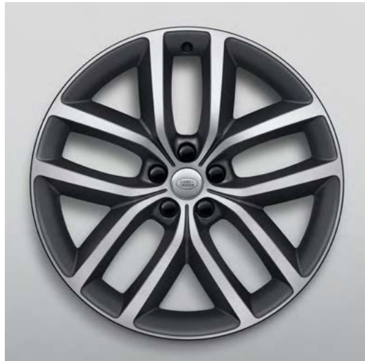
22" Style 5127, Diamond Turned with Satin Dark Grey contrast

Personalise your vehicle with a selection of alloy wheels featuring a wide range of contemporary and dynamic designs.