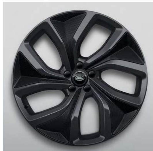
23" Forged Style 5128, Dark Grey Gloss with Carbon Fibre inserts