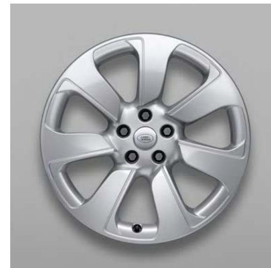
20" Style 7020