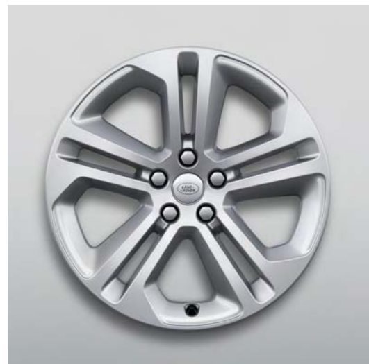
20" Style 5125

Personalise your vehicle with a selection of alloy wheels featuring a wide range of contemporary and dynamic designs.