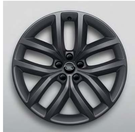
22" Style 5127, Satin Dark Grey